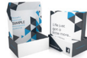
Small Volume Digital Printing