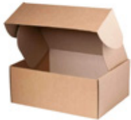
Die Cut Boxes