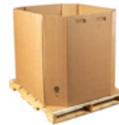
Gaylord boxes / Octagon boxes