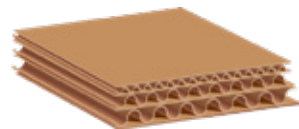
Triple & Quad Wall Boxes