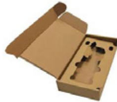
Custom Die Inserts